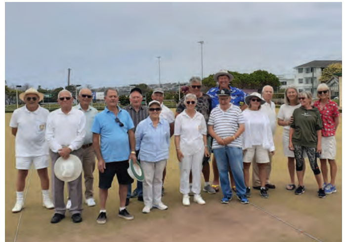
Knock Out Tournament

Thank you to all for making the tournament such a happy day!