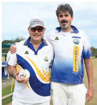
Men's Club Champion final