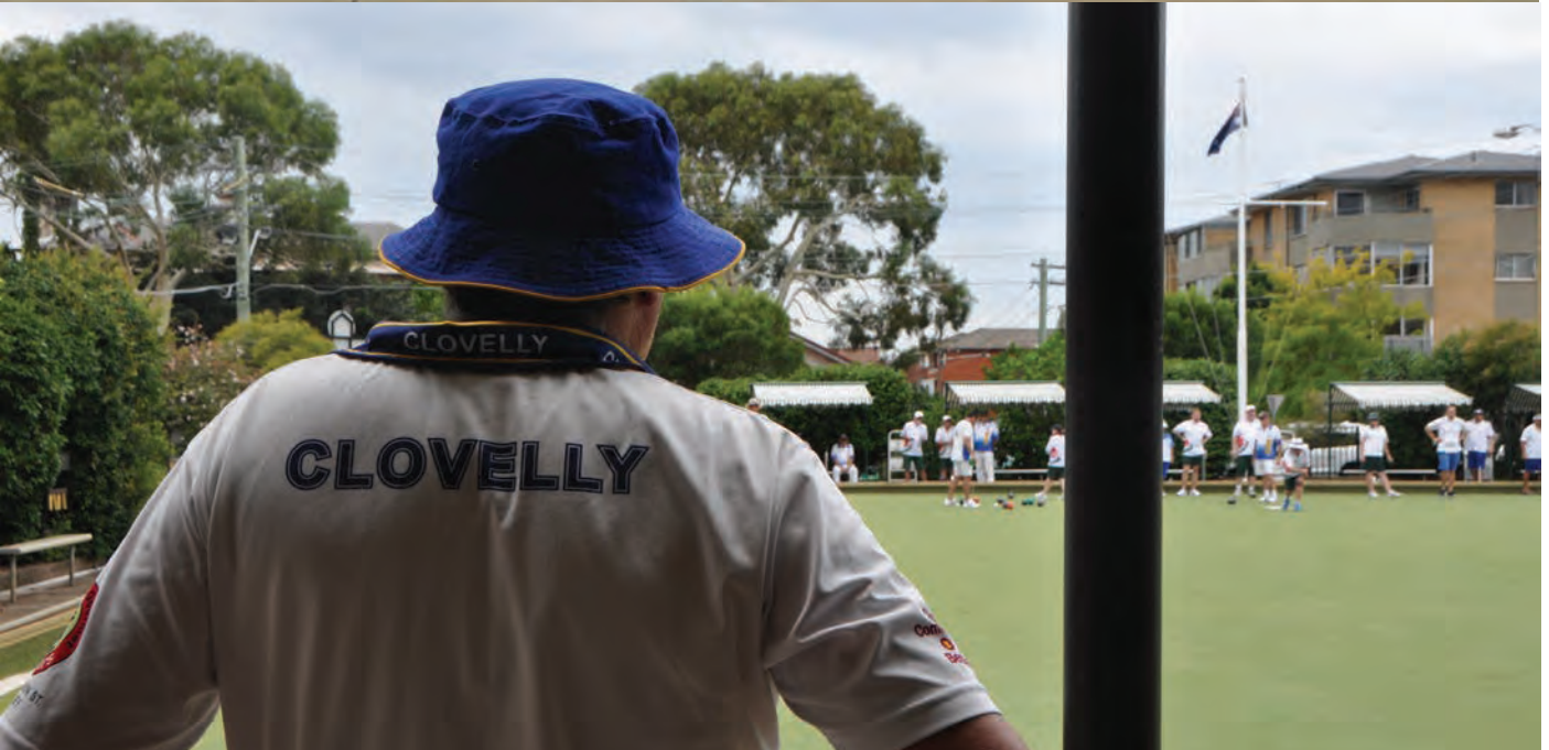
Clovelly playing in Pennants over the years