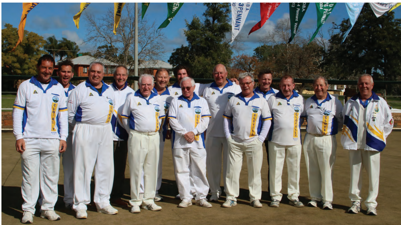
Men's State Finals in Narrandera 2016

Players put stickers on their bowls to indicate which club they are from. You can see ours on the front page of this newsletter.