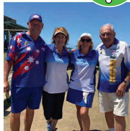
Mixed Pairs final